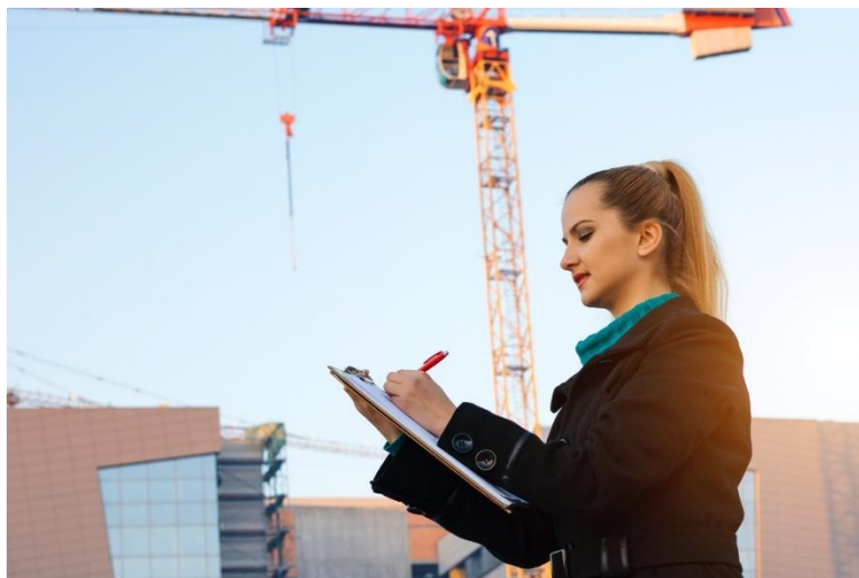
Visitor signing in

Encouraging visitors to use hand sanitiser or handwashing facilities as they enter the site.