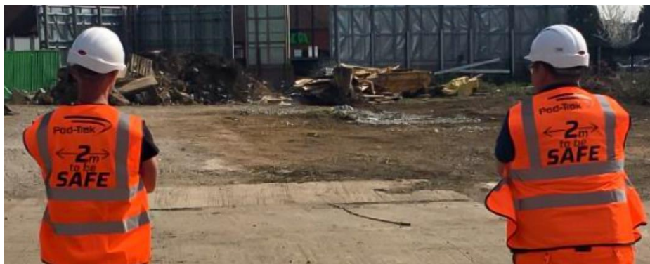
Uniform signage for workers to provide clear messaging